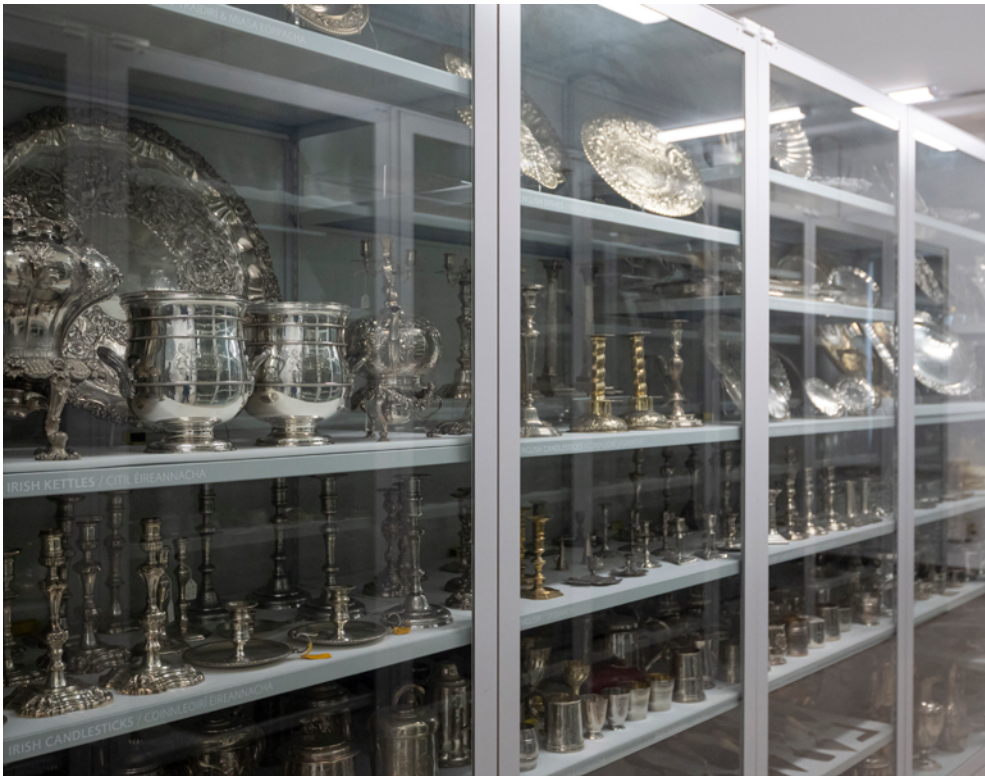
Asian Art, Ceramics, Glass & Silver (Ground Floor)

I might hear the humidifiers in some galleries. They are loudest in: