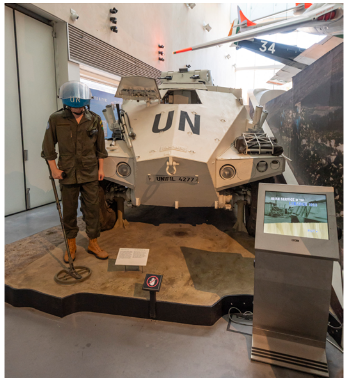
Tanks and planes