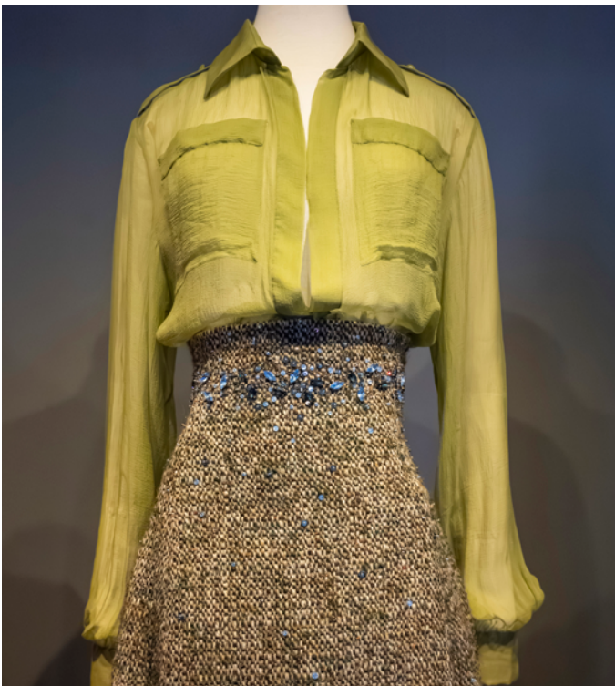
Clothing from the past