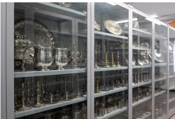
Asian Art, Ceramics, Glass & Silver which also has fluorescent lighting (Ground floor)