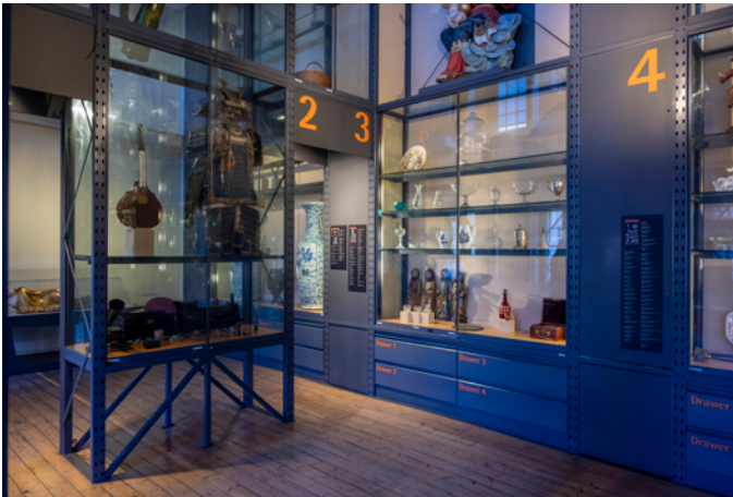
Out of Storage (1st floor)

The galleries with the most reflections are: