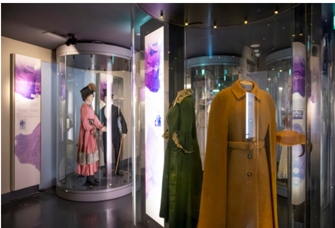
Clothing & Jewellery (3rd floor)