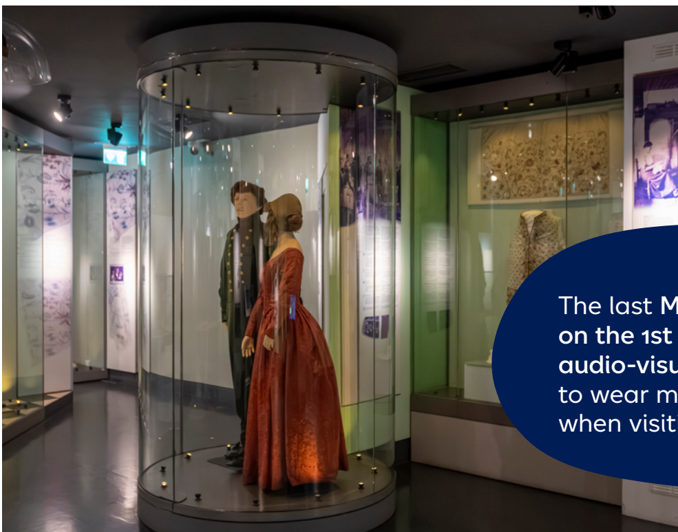
Clothing & Jewellery (3rd floor)

The last Military Life Gallery on the 1st floor has noisy audio-visuals. I might want to wear my ear defenders when visiting this gallery.